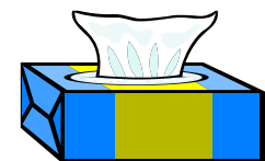
New tissue paper