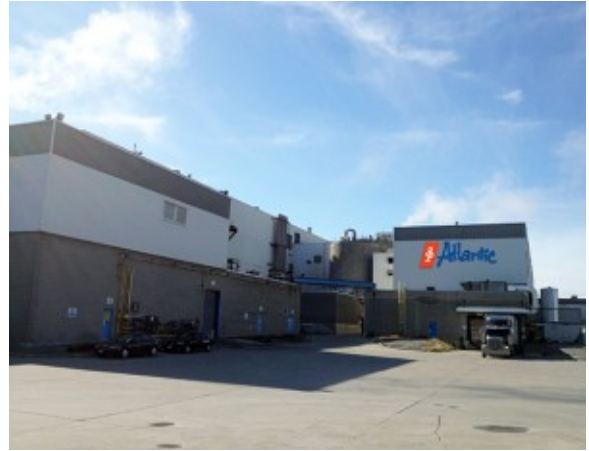
Atlantic Packaging – Whitby

Canadian mills have been lightweighting their containerboard for years. Three recent developments are Atlantic Packaging converting its Whitby, Ontario newsprint mill into a new 100% recycled linerboard mill producing low basis weights (lighter paper) with enhanced strength properties. Across the border in Niagara Falls, New York, the new Greenpac mill 1 is also producing a lighter weight 100% recycled high performance linerboard. And Kruger is building a new light-weight board mill in Trois-Rivières, Québec.